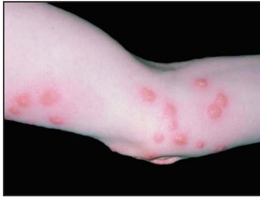
Bed bug bites.

Bed bugs are not known to spread disease. Bed bugs inject a small amount of saliva into the skin while feeding. An allergic reaction to the saliva may cause the area around the bite to become swollen and itchy. Do not scratch bites, as this may worsen the irritation and itching and may lead to a secondary infection.