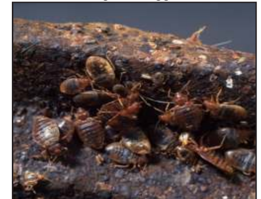
Bed bugs infestation.